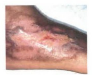
6 weeks post treatment